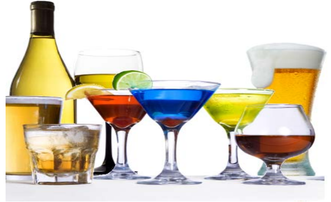
Reported Usual Alcohol Source Among Current Drinkers